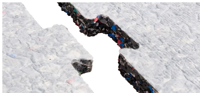
Puzzle shaped sheets